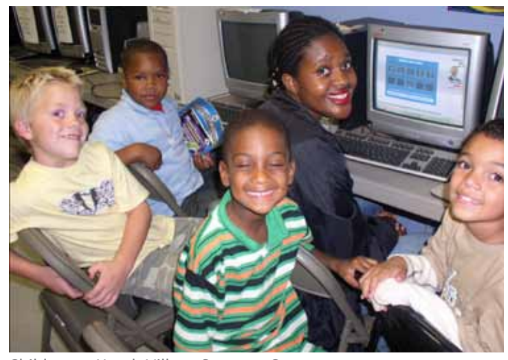
Children at Youth Village Summer Camp

This award will sponsor a Guest Suite at the Fisher House to unite families during recovery and continue to support the Children's Fund, which provides for the children of families staying at the Fisher House. The House provides a safe haven for families while their hero is healing.